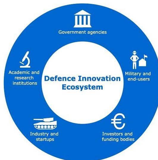
Figure 1 Key stakeholders in Defence Innovation Ecosystem

ecosystems play a crucial role (Granstrand & Holgersson, 2020). The key definitions of the study’s main concepts are outlined in Table 1. While the list could be expanded and refined, these represent the most essential concepts.