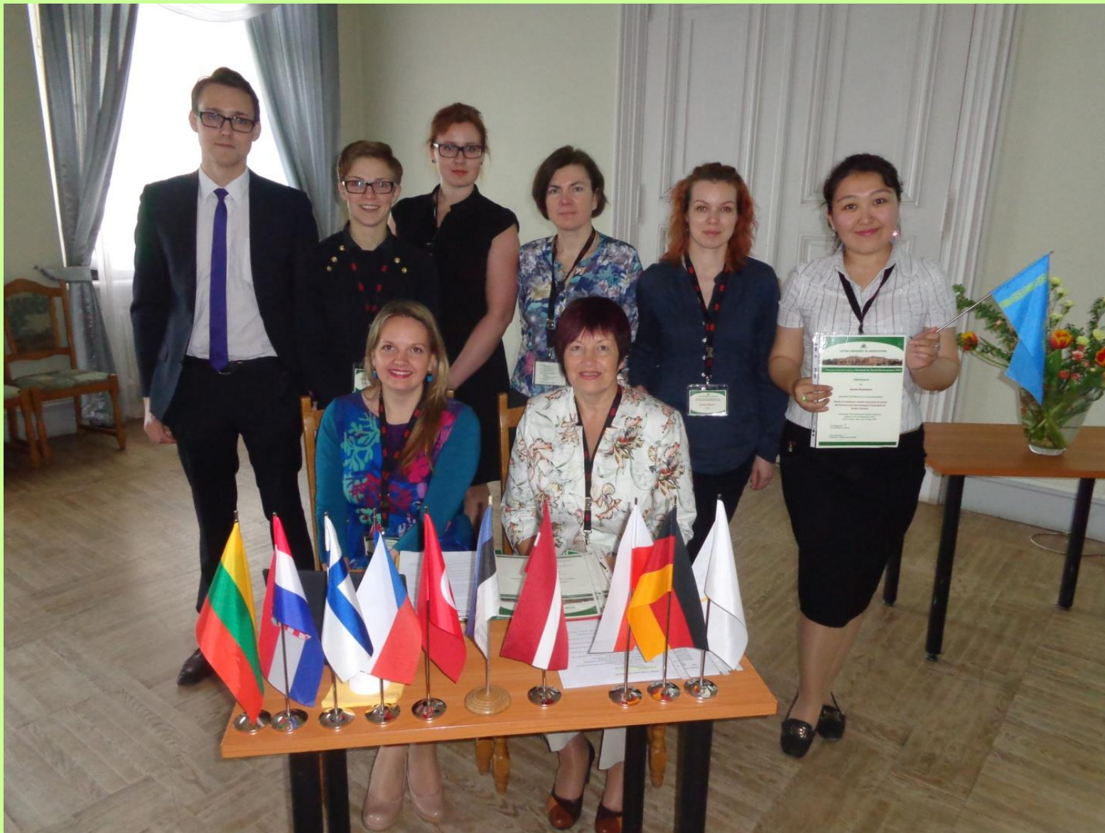
After Veterinary Medicine Session Research for Rural Development 2016