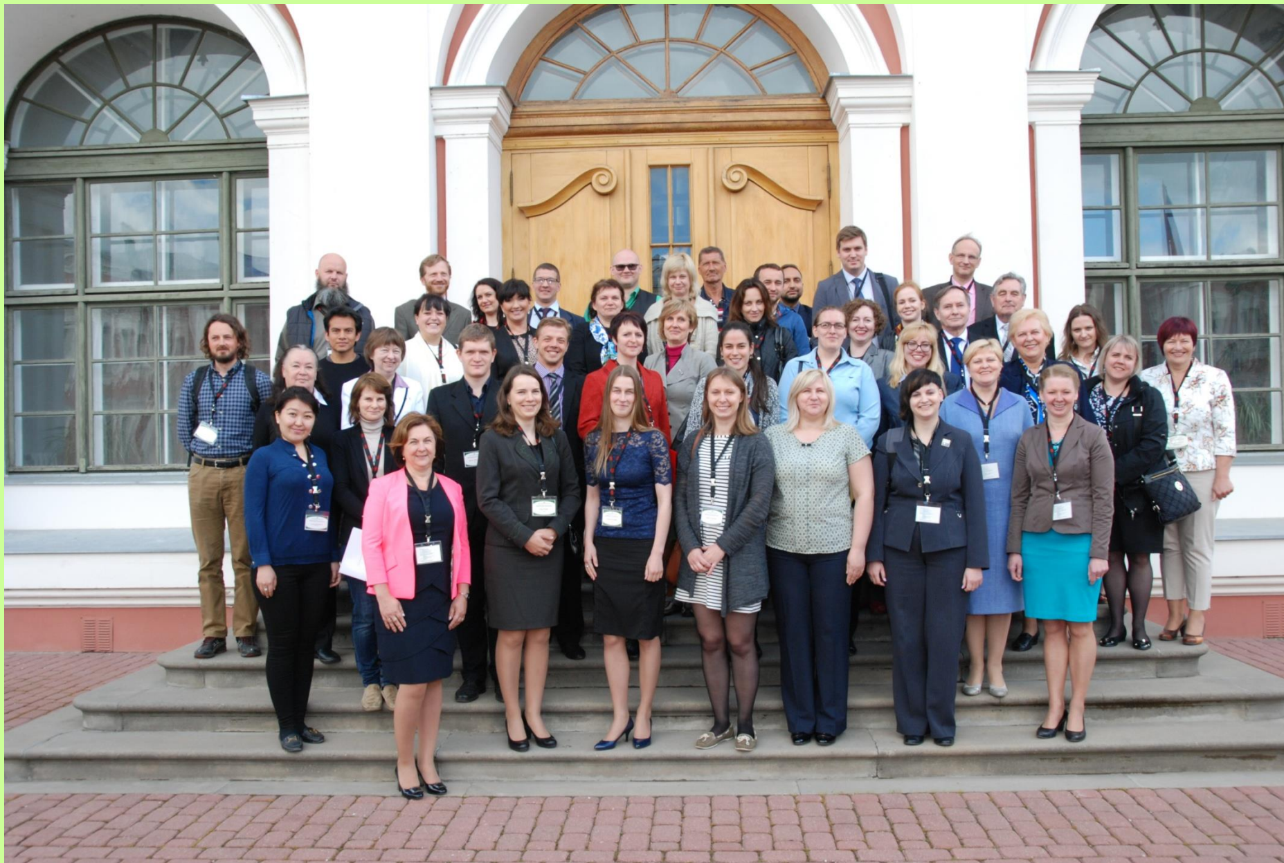
The Participants of the Conference after Plenary Session Research for Rural Development 2016