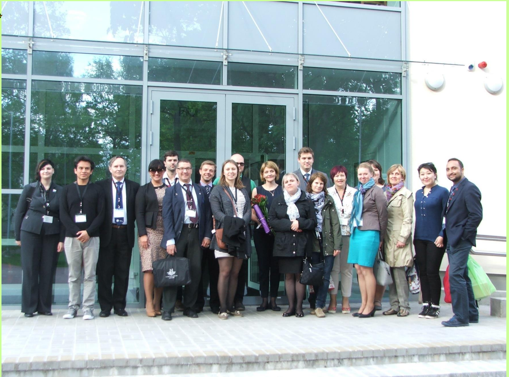
The Participants in front of New Building of Faculty of Food Technology of Latvia University of Agriculture Research for Rural Development 2016