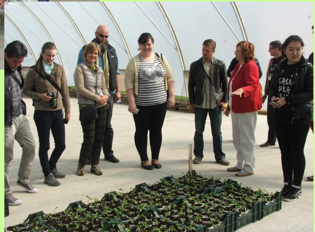
Participants at the Institute of Agricultural Resources and Economics located at Priekūļi county Research for Rural Development 2016