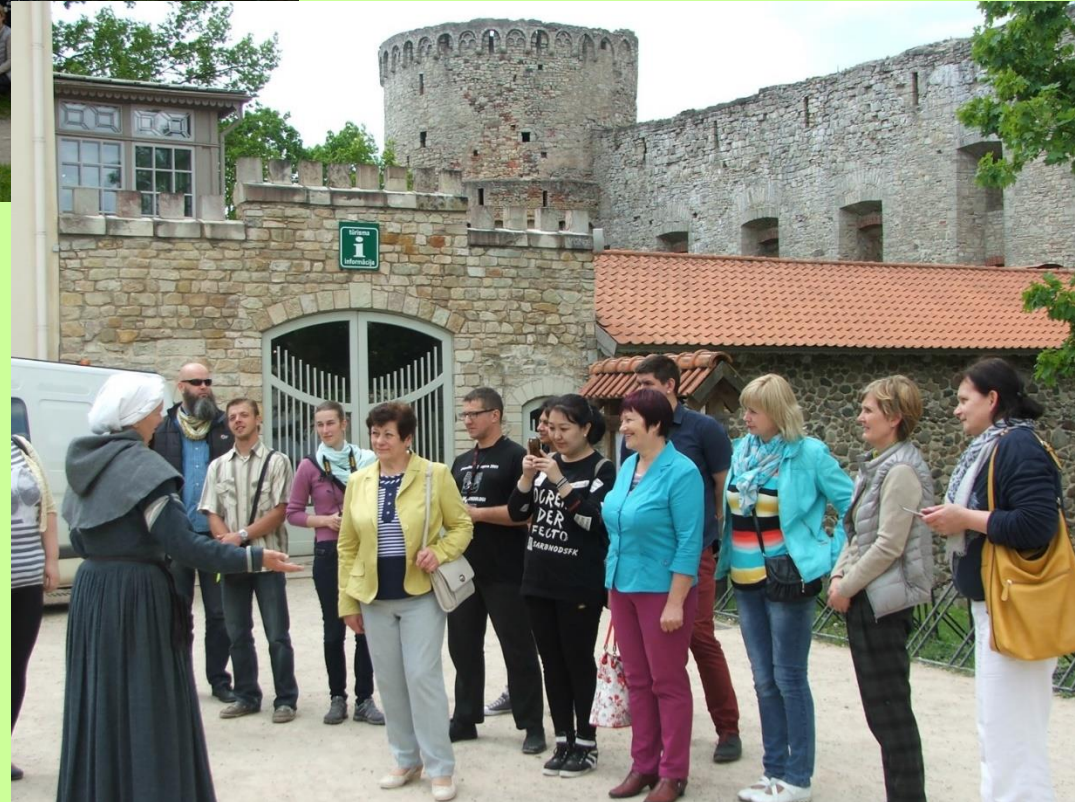
The Participants at the Cēsis Castle Research for Rural Development 2016