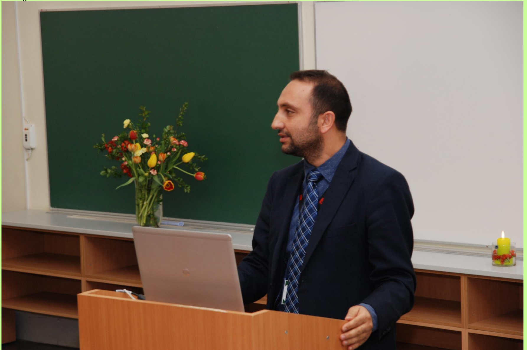
Plenary Session Research for Rural Development 2016