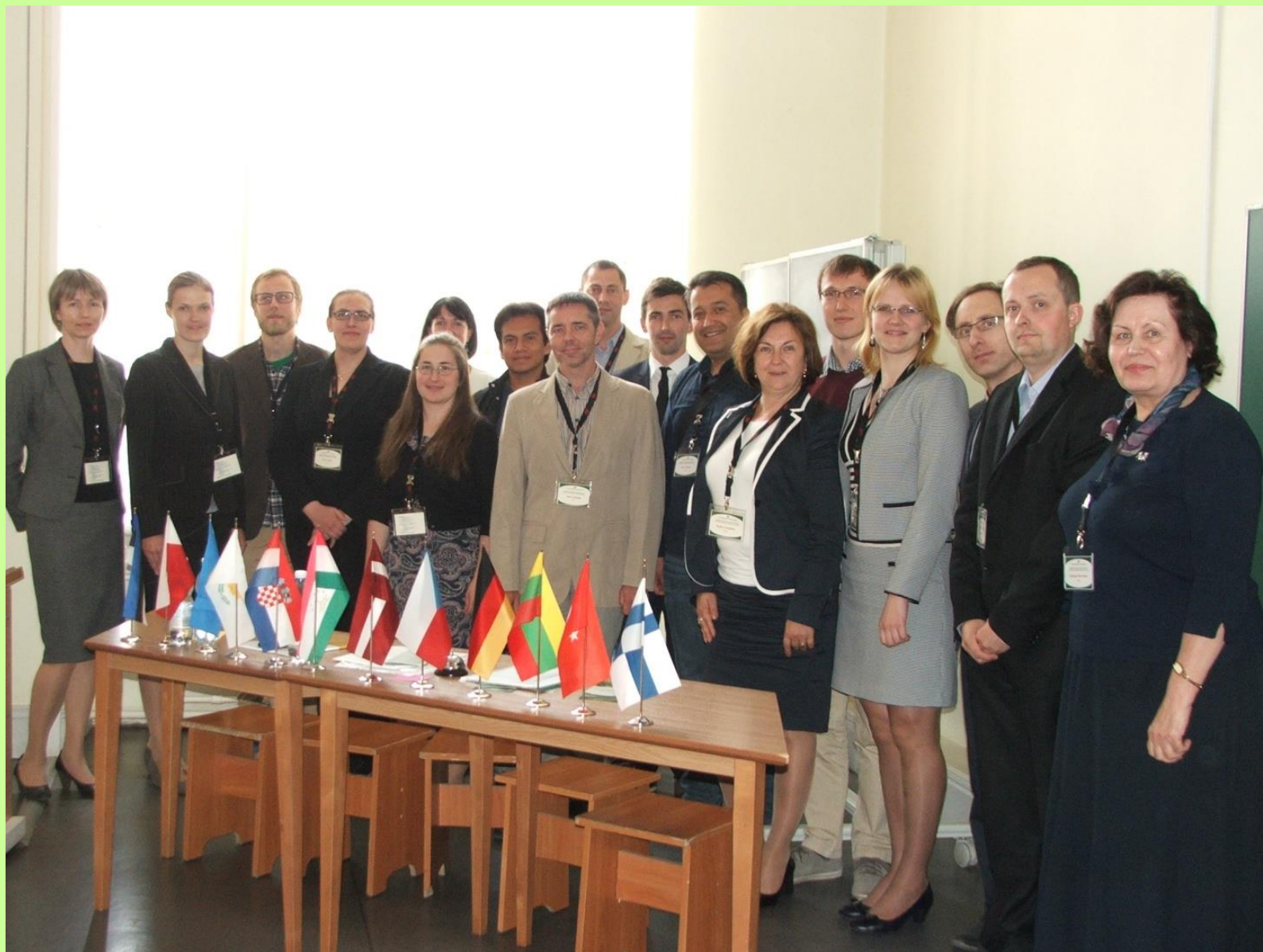
After Water Management, Rural Engineering, Environmental Engineering and Landscape Architecture, Information and Communication Technologies, Agricultural Engineering , Education Session Research for Rural Development 2016