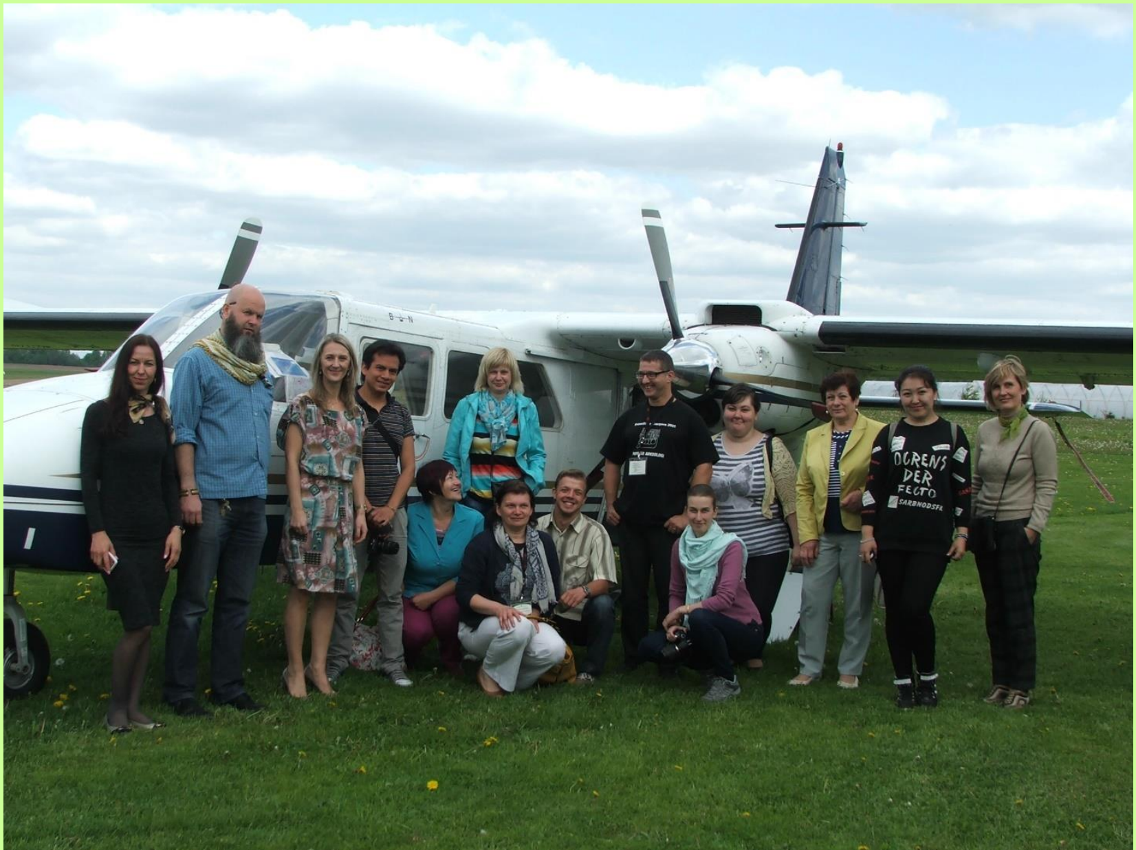
The Participants at the Institute for Environmental Solutions at the Priekuļi county Research for Rural Development 2016