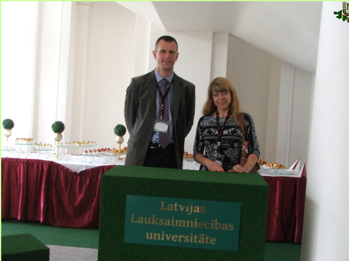
Participants of Annual 22nd International Scientific Conference Research for Rural Development 2016