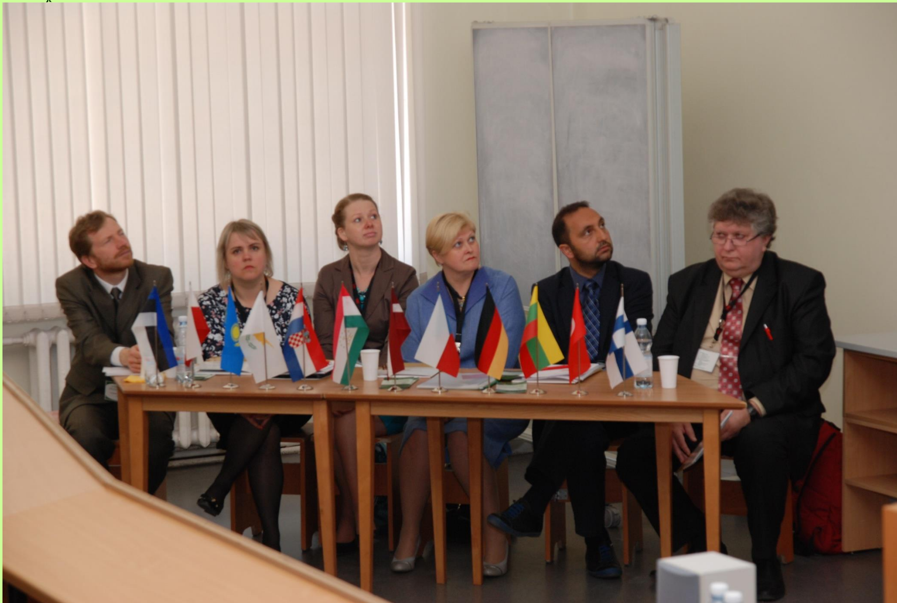
Authors of Presentations at the Plenary Session Research for Rural Development 2016