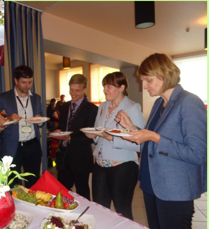
Reception of Participants of Annual 22nd International Scientific Conference Research for Rural Development 2016