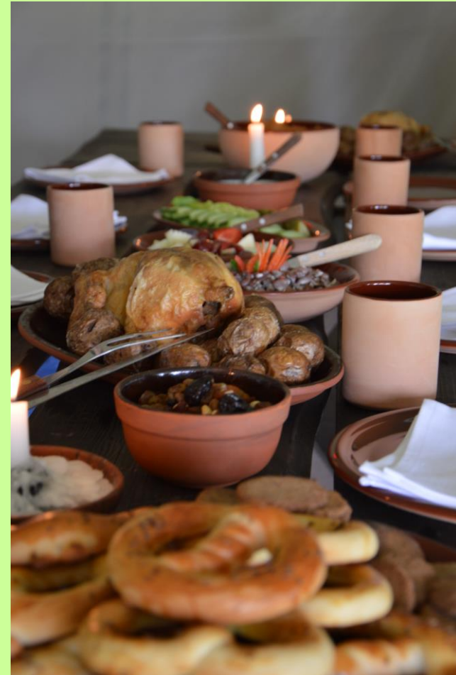
The Participants at the Cēsis Castle and Medieval Feast Research for Rural Development 2016