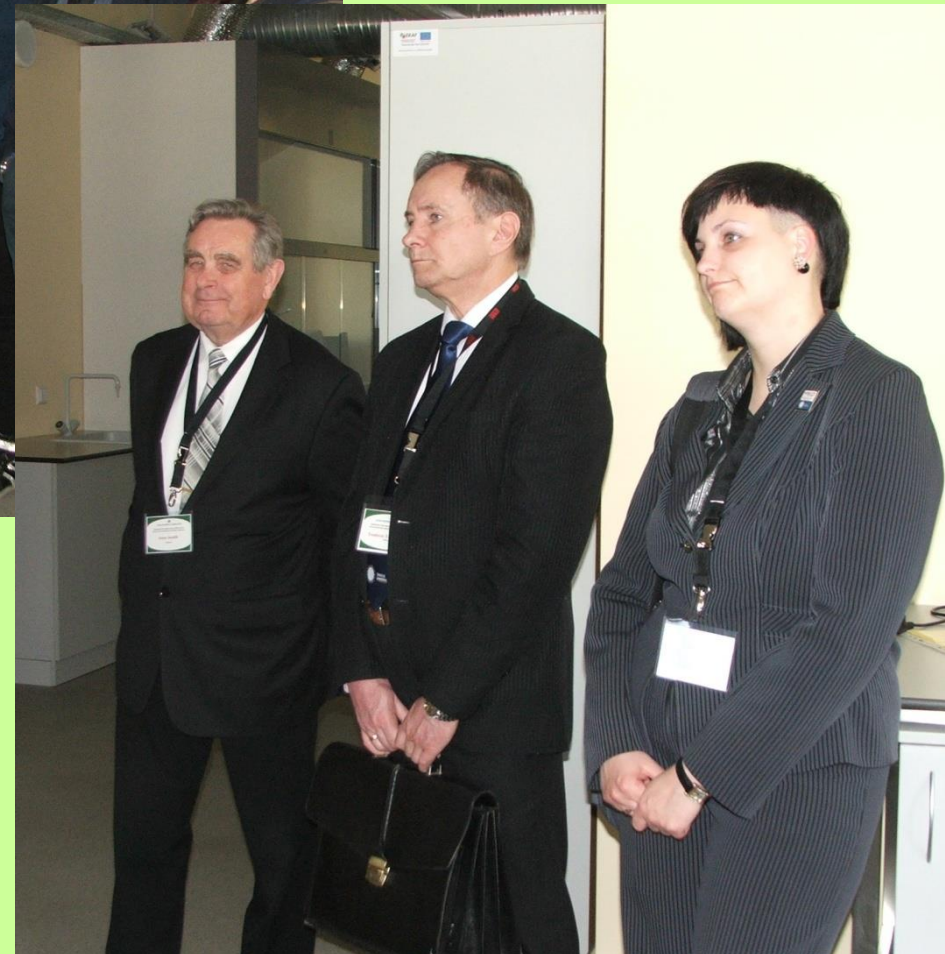
The Participants at the New Building of Faculty of Food Technology of Latvia University of Agriculture Research for Rural Development 2016