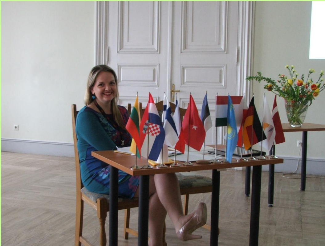
Chairperson during the Veterinary Medicine Sessions Research for Rural Development 2016