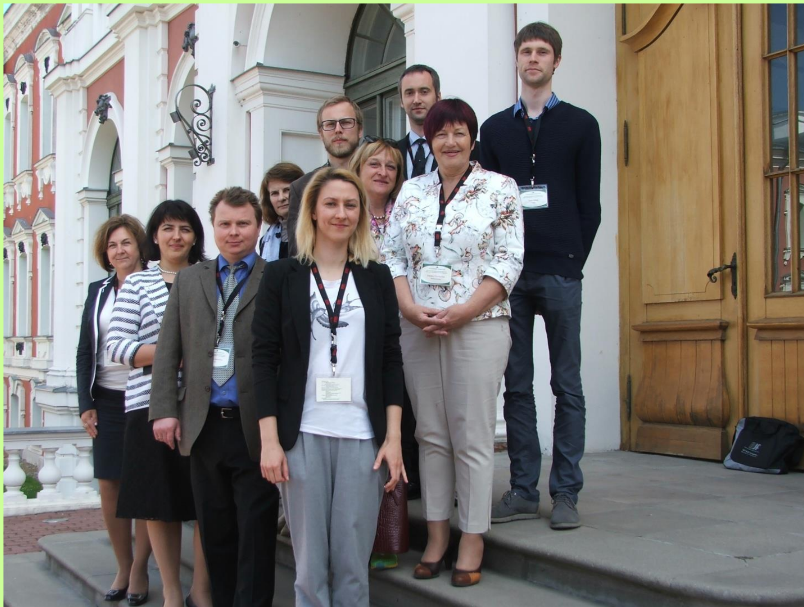
The Participants in front of Main Building of Latvia University of Agriculture Research for Rural Development 2016